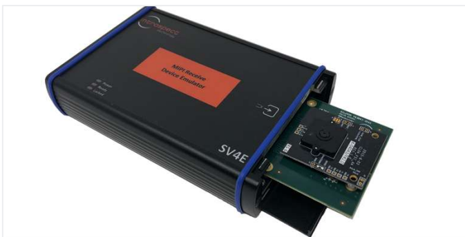
Simple Connection Scheme